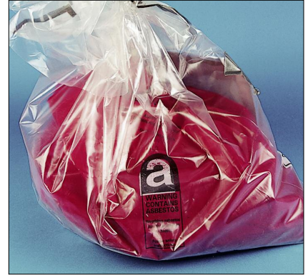
All waste should be double-bagged or double-wrapped in plastic sheeting, with the correct hazard warning signs attached.